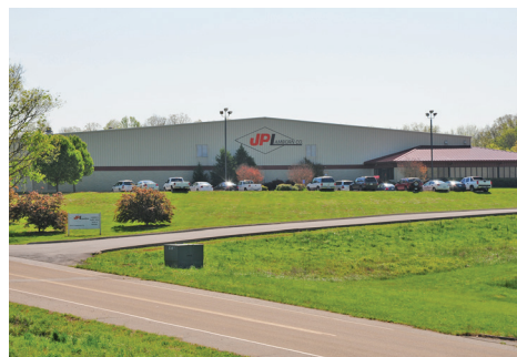
JP Lamborn Company