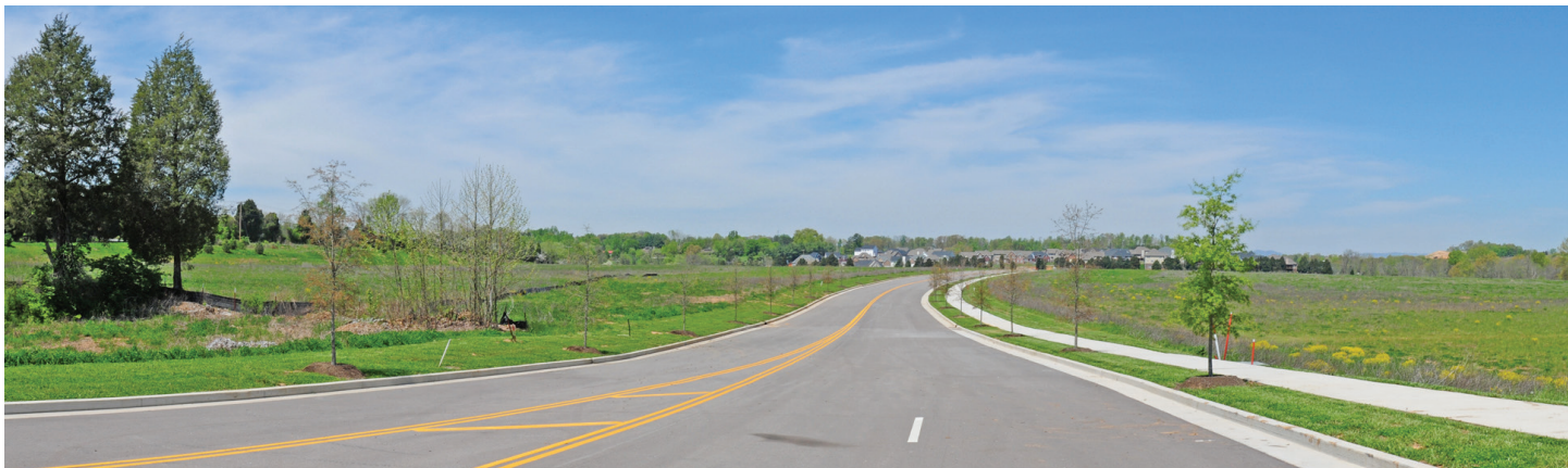
Graded, development-ready sites with full utility service await at Hardin Business Park.

17 Market Square #201 Knoxville, TN 37902 (865) 637-4550 www.knoxvillechamber.com