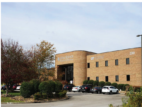
Oak Ridge National Lab